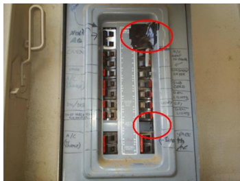
43. Panel Notes