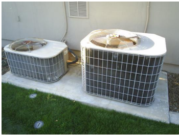
38.2. Air Conditioning