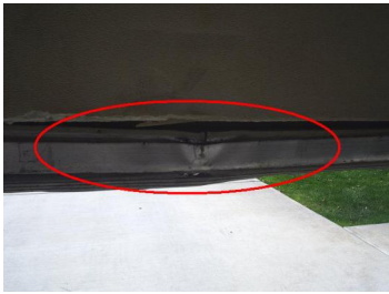
50. Vehicle Door