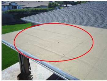
20a. Shingle / Shake